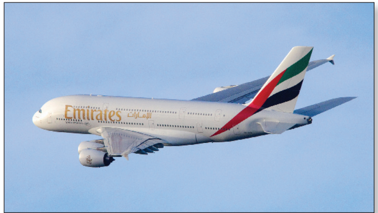
Emirates' success is due in part to its diverse product offerings.